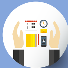
Real-time Tracking Diary