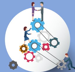
Business Matchmaking Team Assistance