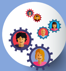
Making the Right Match